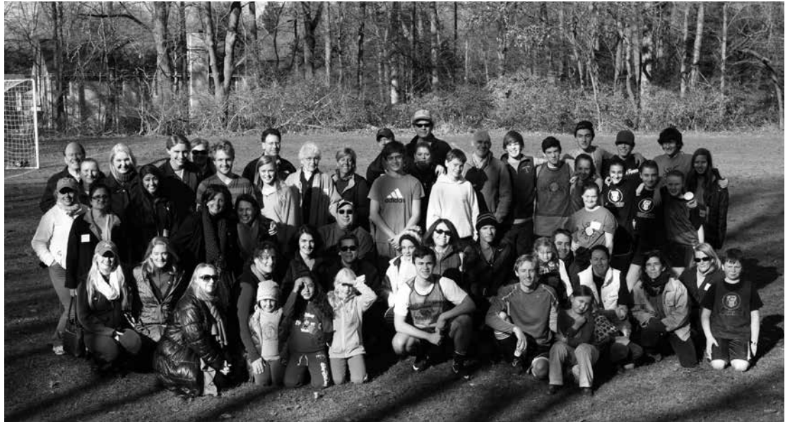
On a crisp November day, to cap off our annual Fall Clean Up, we reprised the Alumni Reunion and soccer game – complete with some Montessori alum parents in play! Thanks to all who came and enjoyed our chili lunch and alum soccer game!